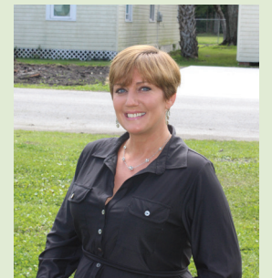
ONE OF OUR CROSSROADS GRADUATES

The Crossroads approach addresses all areas of life: social, emotional, physical, and spiritual. We are committed to help our residents reach the personal growth and wholeness they desire. Confidentiality is maintained in each situation.